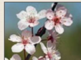
Spring cherry blossoms @ Puddicombe Estate