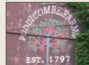
Old barn logo at Puddicombe Estate