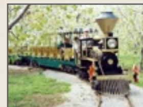
Spring on the train ride @ Puddicombe Estate

EGGS, BACON OR SAUSAGE, TOAST, JAM, COFFEE, TEA & JUICE