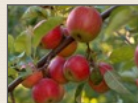
P-Y-O Apples @ Puddicombe Estate