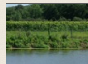
Pond view from the Caboose porch @ Puddicombe Estate