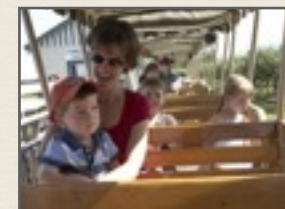
Family train ride @ Puddicombe Estate