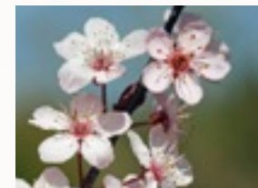
Spring cherry blossoms @ Puddicombe Estate

Includes: Bottle of wine, eggs, bacon or sausage, toast, jam, coffee, tea, juice. Plus, a gift basket & lunch in our Country Cafe before leaving