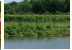
Pond view from the Caboose porch @ Puddicombe Estate