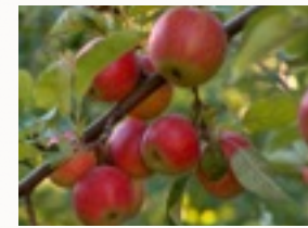
P-Y-O Apples @ Puddicombe Estate

Includes: Bottle of wine, eggs, bacon or sausage, toast, jam, coffee, tea and juice.