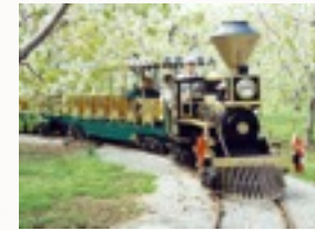
Spring on the train ride @ Puddicombe Estate

Includes: Continental breakfast of fresh baked muffins, coffee, tea and juice