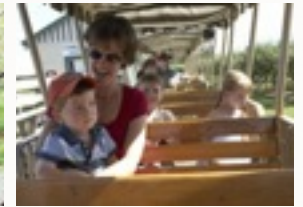
Family train ride @ Puddicombe Estate